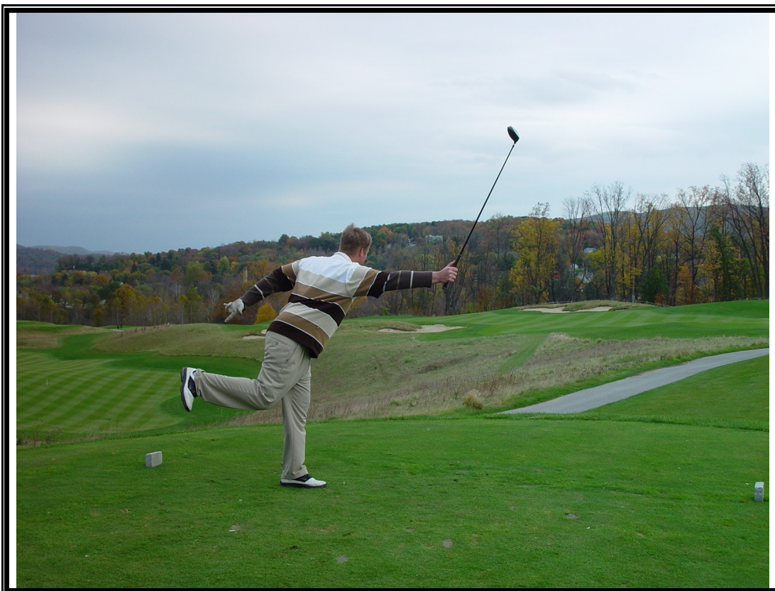
Employee Tournament golfer celebrates a tee shot at the Ballyowen Golf Club in New Jersey