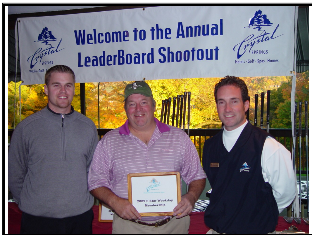
Tournament winner receives recognition form Golf Pro and Golf Club Manager