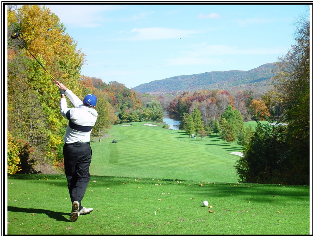
Golfer tees off on Lakeside #1 at the Great Gorge Golf Club in New Jersey