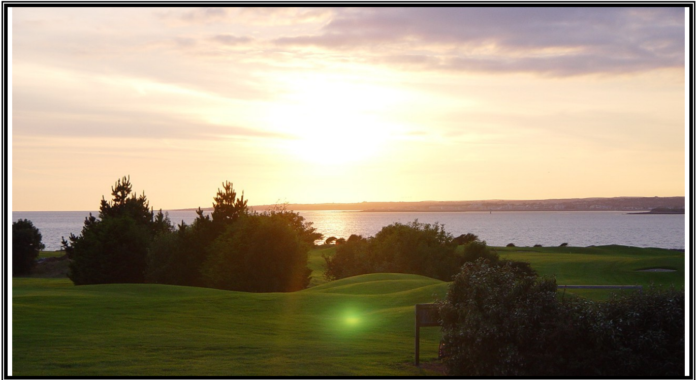
This photograph was taken of the 9 th hole of the Galway Golf Club in Ireland at sunset

Consider the beauty of a sunset at the Crystal Springs Golf Resort’s Ballyowen Golf Course, or the sunset over Galway Bay from the 9 th hole of the Galway Golf Course in Ireland, the deer sharing the Crystal Springs Golf Course with players, or of the old Dooks Links Golf Course in County Kerry, Ireland. All are spectacular in their beauty and you don’t even need to swing a club.