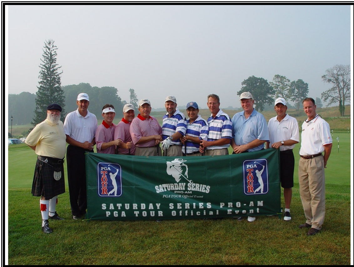
Team photographs at the PGA Tour Saturday Series at the Ballyowen Golf Club in New Jersey