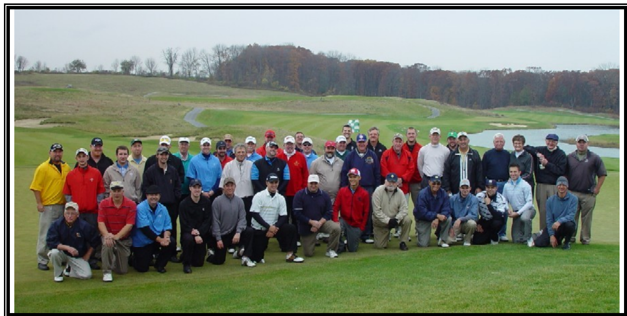
An employee outing held at the Ballyowen Golf Club in New Jersey