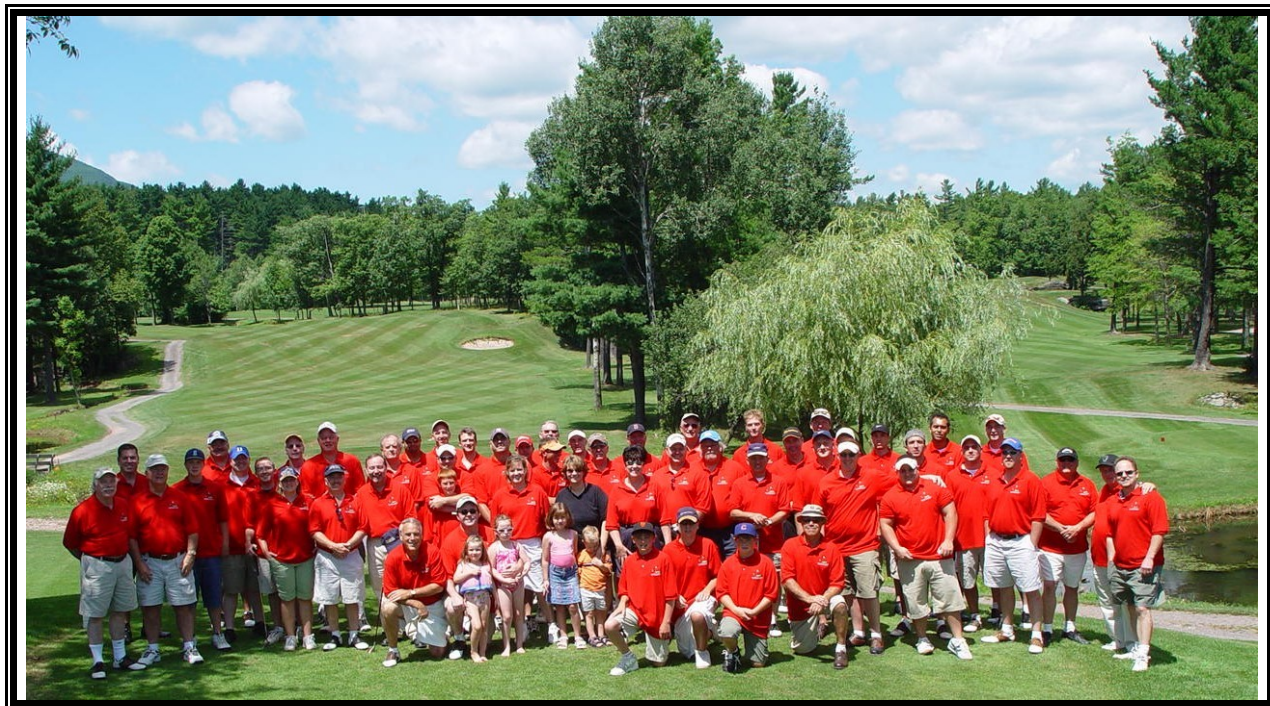
Family outing held at the Blackhead Mountain Golf Club in the Catskills

Many golf event organizers and golf course general managers like to collect photographs of major golf events and hang them in their offices. They provide an attractive history of the event.