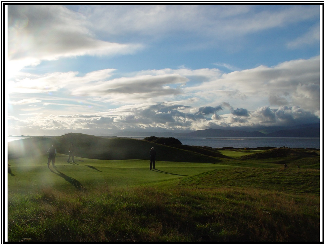
Dusk at Dooks Golf Club overlooking Dingle Bay – Established 1889, County Kerry, Ireland

A photojournalistic service provided to golf outing organizers, golf courses and event sponsors