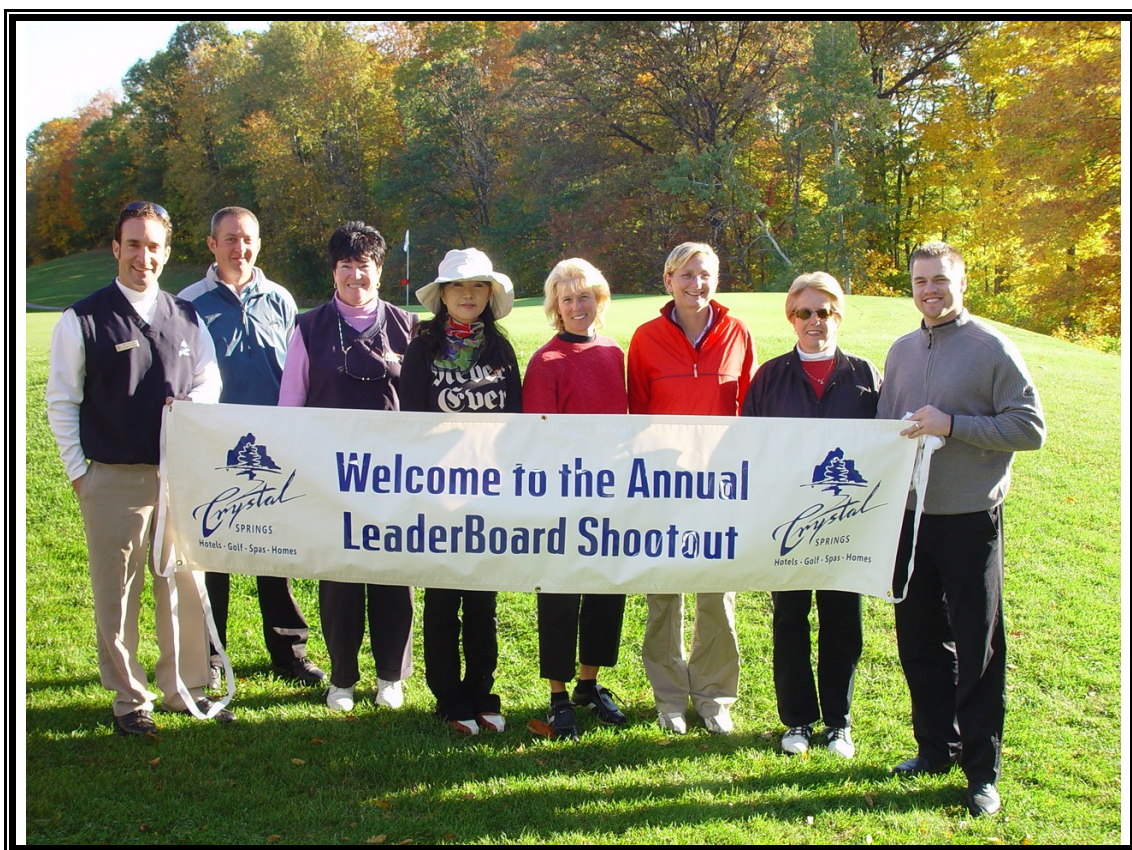
The lady contestants in the Leaderboard Shootout at the Great Gorge Golf Club New Jersey